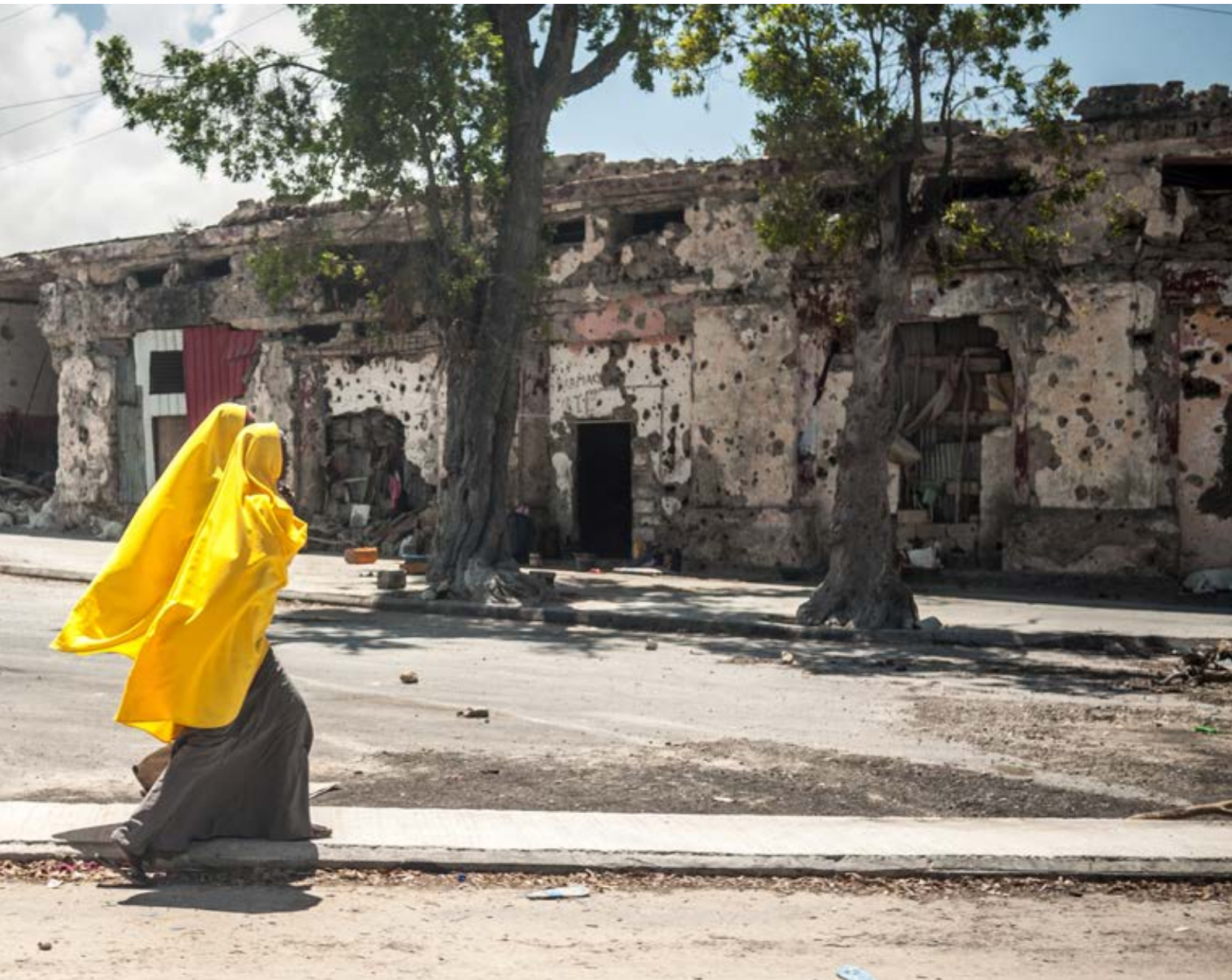
CRISIS GROUP/RICHARD HORSEY

Women form an important social base for Somalia's Al-Shabaab insurgency, partly explaining the Islamist rebels' resilience. In 2019, our field researchers proposed new policies – like integrating women into the security services – to help the government steer a safer course. Mogadishu, Somalia, 2014.