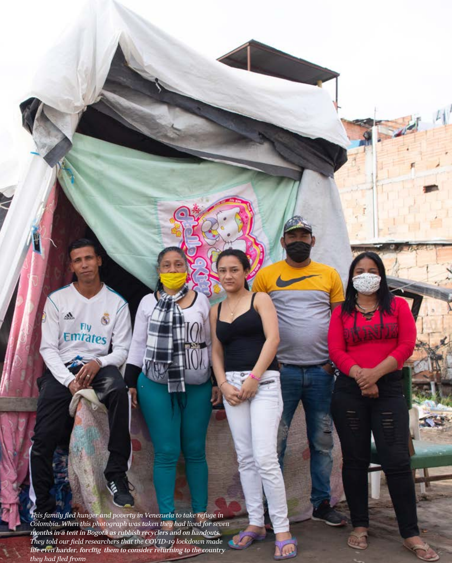
This family fled hunger and poverty in Venezuela to take refuge in Colombia. When this photograph was taken they had lived for seven months in a tent in Bogotá as rubbish recyclers and on handouts. They told our field researchers that the COVID-19 lockdown made life even harder, forcing them to consider returning to the country they had fled from.