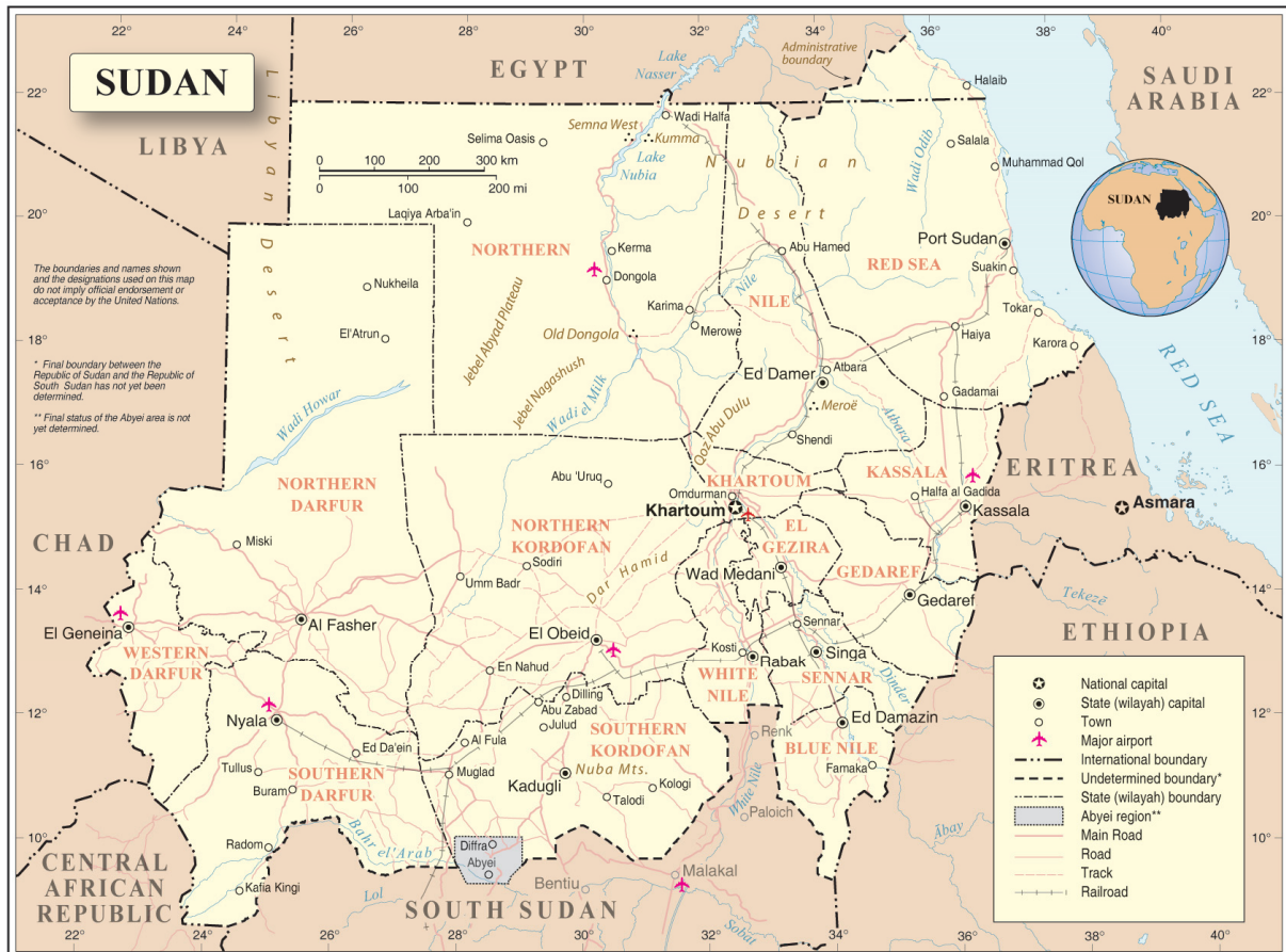
Map No. 4458 Rev.2 UNITED NATIONS March 2012