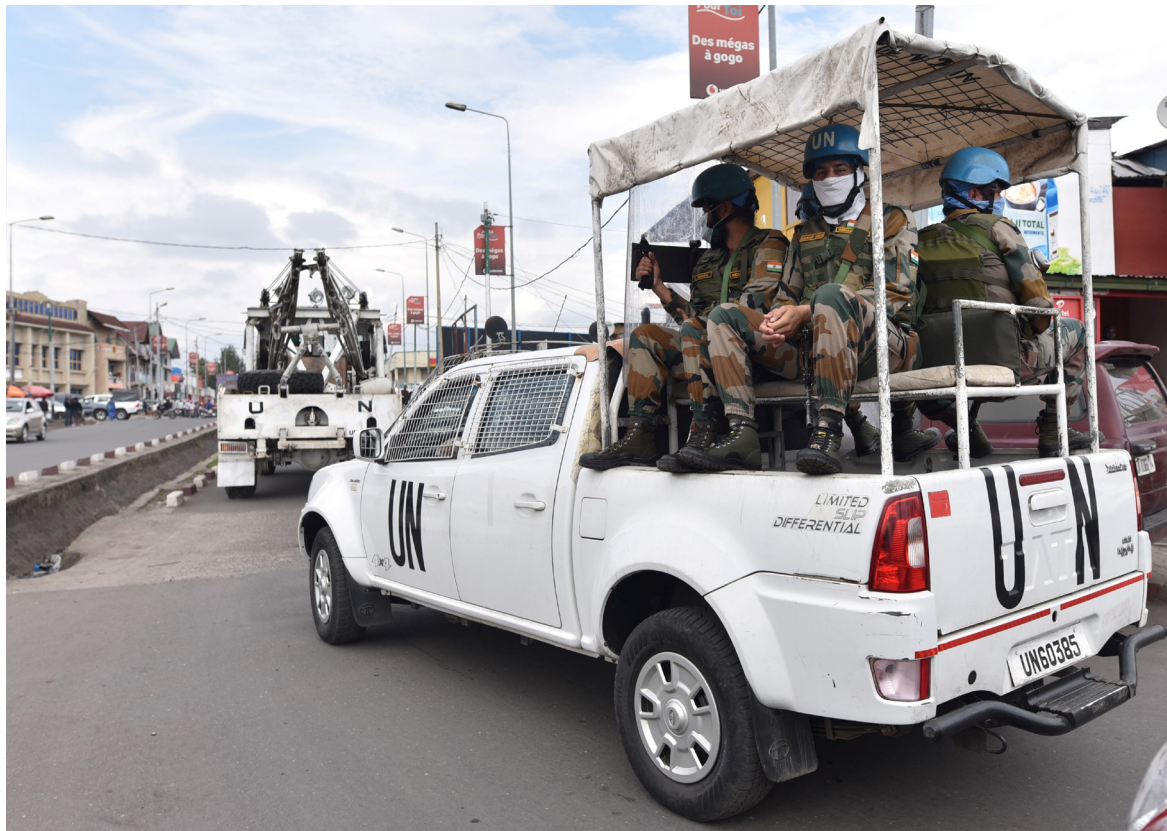
MONUSCO peacekeepers patrol amid the COVID-19 outbreak, in Goma, eastern Democratic Republic of Congo, 19 March 2020.

Philippines (CPP) and the National Liberation Army (in Spanish, Ejército de Liberación Nacional, or ELN) in Colombia. Both appear genuinely concerned by COVID-19's health risks and economic consequences for the people they say they represent. In the Filipino case, lockdowns in many cities and provinces have threatened food and medical supplies to the CPP's supporters, and limited Communist fighters' freedom of movement. A ceasefire, if respected, should enable these supplies to get through. In Colombia, the ELN tied a promise to cease hostilities for one month to a demand for economic aid to low-income families, farmers and businesses, which it presumably sees as important for boosting its popular profile.