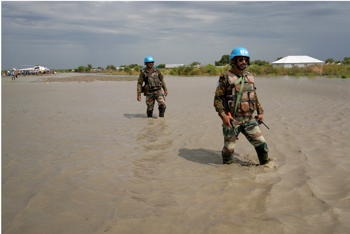
UN peacekeepers walk through water in Boma state, South Sudan, after heavy rains and floods forced hundreds of thousands of people to leave their homes in November 2019.

becoming scarcer due to rising temperatures and variable rainfall.