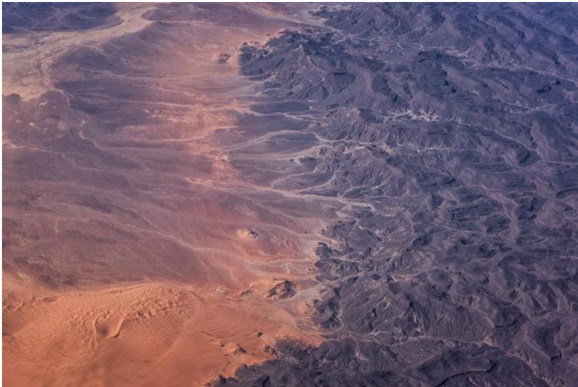
Crisis Group works to mitigate the effects that climate change can have on violent conflict around the world, including in Africa's Sahel region (pictured).

Second, as I mentioned, just as climate risks vary based on different geographies, so too do conflict risks vary based on different politics. Political decisions matter greatly when it comes to how resources are allocated and who can access them, whether distribution is viewed as equitable and fair or iniquitous, and those issues matter greatly when it comes to conflict risks. So we must ask where among the set of most likely climate crises are existing institutions and state capacity weakest, and recommend appropriate policy steps to strengthen those institutions and the effectiveness of state responses.