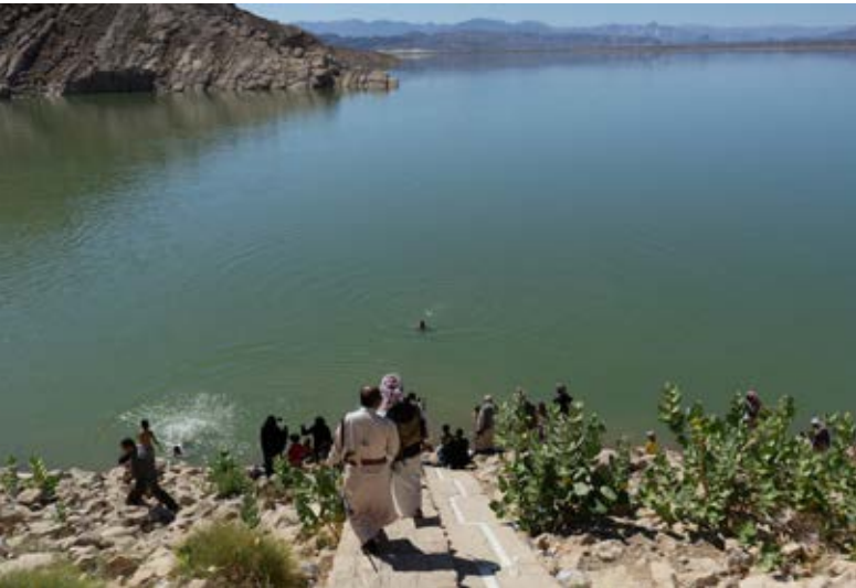
Marib dam, twenty minutes from the front lines.

I decided to take in the sights of Marib, which until the mid-2000s was a popular destination for tourists visiting Yemen. The last time I was here, I hoped to find out more about this former centre of the pre-Islamic Sabaean Kingdom and domain of the legendary Queen of Sheba. But local security forces sent me back to Sanaa, saying they were nervous I'd be a target of the local al-Qaeda branch – a threat residents say the former regime blew out of proportion in order to tighten its grip on the governorate and its valuable oil and gas resources. This time, I had better luck. I visited Sheba's purported burial site and a temple to the Moon God worshipped by the Sabaean. I was not the only visitor; there were plenty of Yemeni tourists there, too.