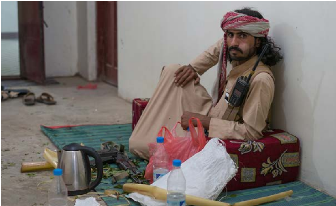
A guard chewing qat .

nationalists like Nasserists; affiliates of Islah , a broad umbrella organisation for the Muslim Brotherhood members and conservative, religious and tribal groups; religious-conservative Salafists; and Socialists, too. At other times, I met with groups of tribal leaders and government, military and economic officials.