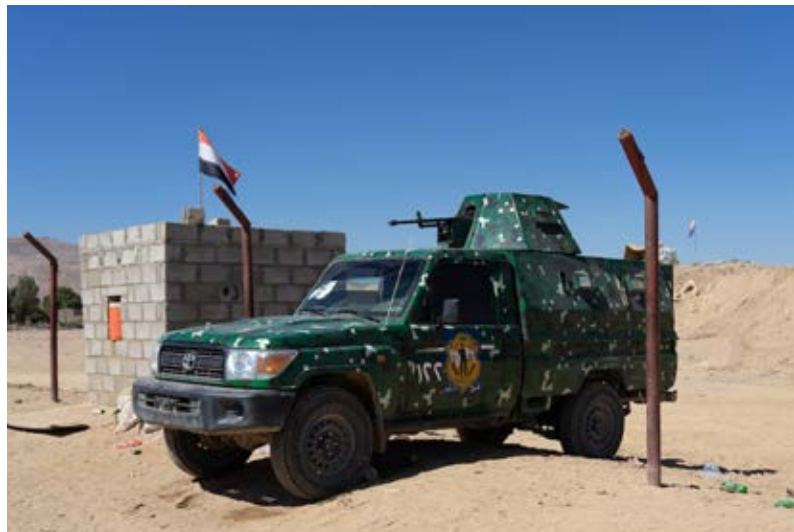
On the way to Marib.

“It's one thing to be told that things are normal and another to experience it in person.”