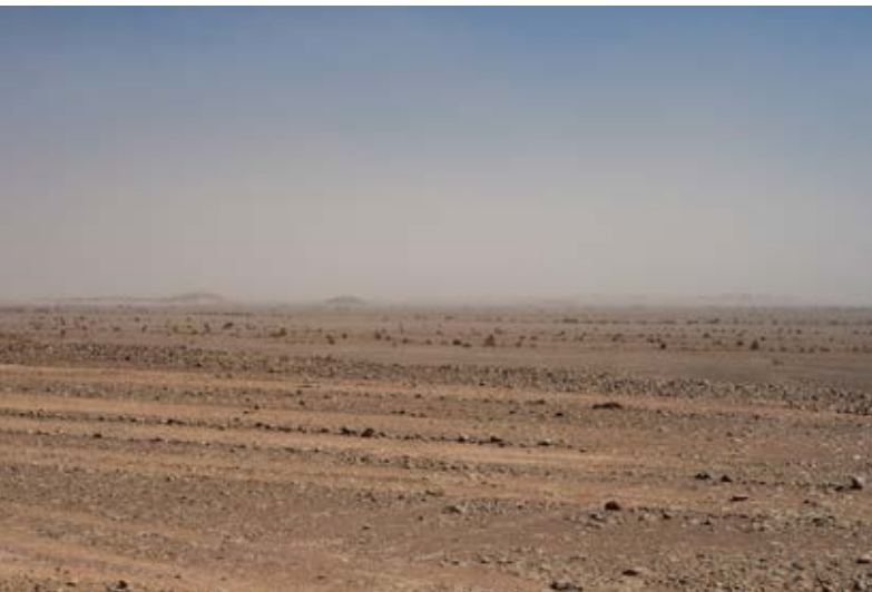
Road to al-Hazm.