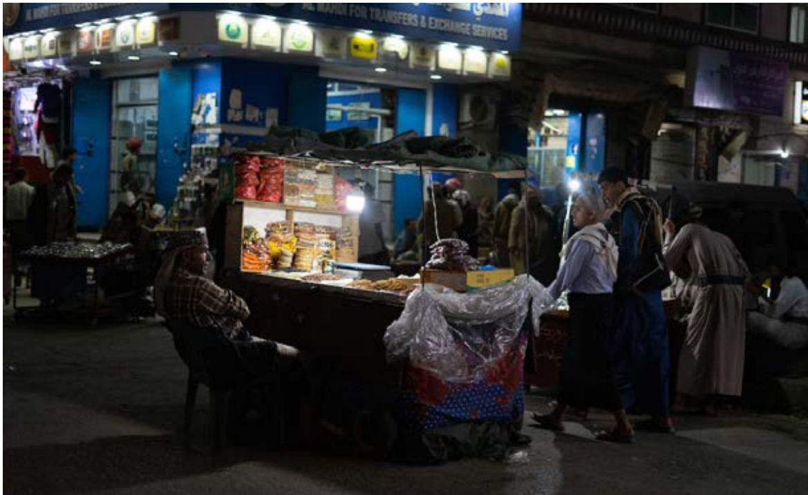
Marib street scene by night.

before the war began in 2015 has grown into a city that local authorities say now houses 1.8 million. The population of the governorate is reckoned to have grown tenfold, from 300,000 people to three million. The International Organization for Migration estimates that 800,000 people fleeing fighting in other parts of the country have come here seeking refuge.