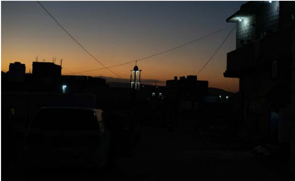
View of Marib by night.

escalated a nascent civil war into a protracted regional conflict, fighting in the north has the potential to once again dramatically reshape the country's political landscape.