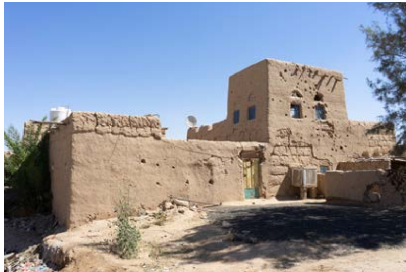
Traditional Yemeni mud-brick house in Serwa.

The original dam was a pillar of the Sabeen kingdom, but it collapsed around 570 AD, the onrushing water devastating the region. The ancestors of the Nahyan family, the founding dynasty of the Gulf emirate of Abu Dhabi, are said to have emigrated from the Marib area at this time. In the 1960s and 1970s, Sheikh Zayed, Abu Dhabi's emir and founder of the United Arab Emirates, repaid his family's debt to history by financing the construction of the dam here today.