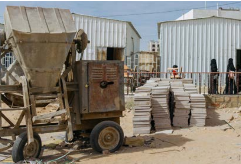
Saba Regional University expanding, Marib.