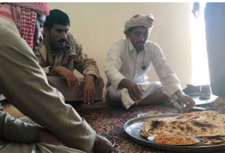
Breakfast with armed guards.

Marib is just half an hour from the front lines, which seems to bolster a distinct sense of municipal pride. People overwhelmingly wanted to tell me about the city's growth and