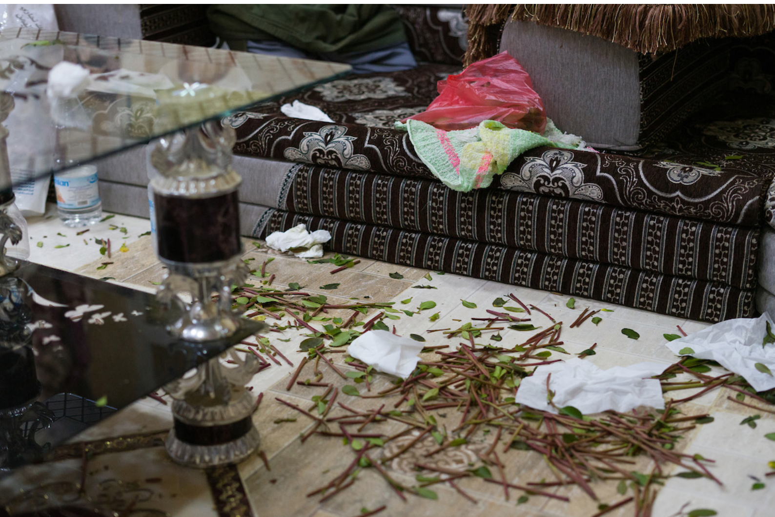
Discarded qat stems after a shared chewing moment.

“A fight for Marib could add a new catastrophe to what is already the world's most serious humanitarian emergency.”