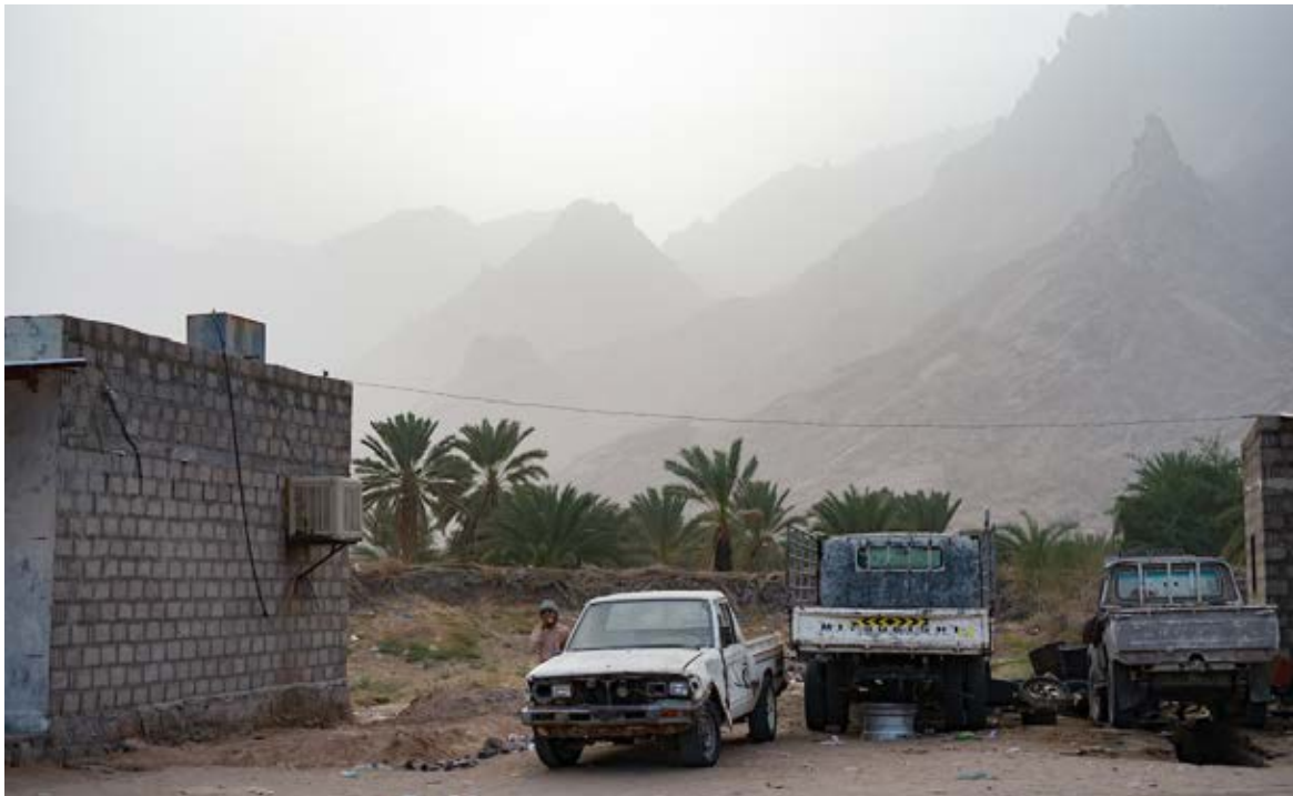
Juba, south of Marib.

the war. There are more women than men at the Saba Regional University.