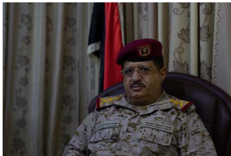
General Mohammed al-Maqdashi, defence minister in the Yemeni government.