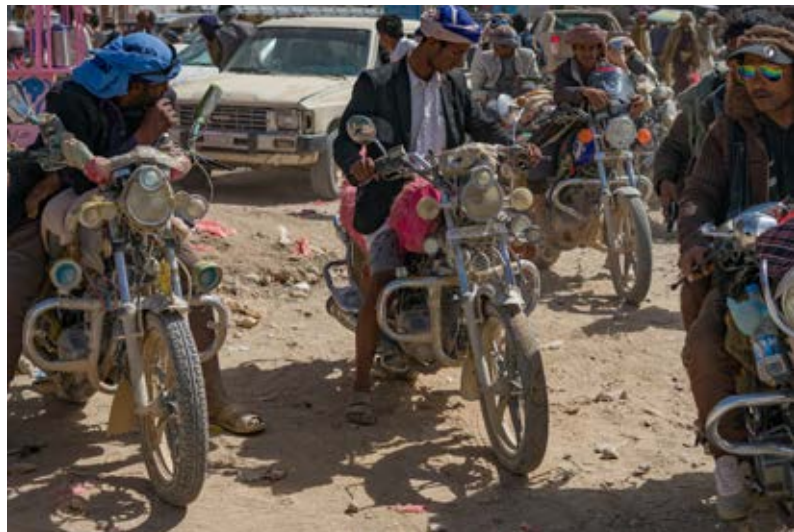
Motorbike taxis in al-Hazm.