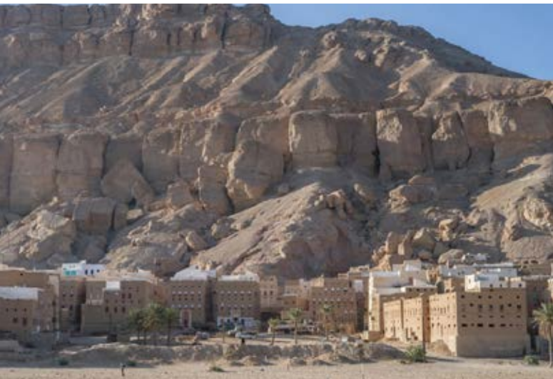
Cliffs and mud-brick skyscrapers in Shibam.

the southern port of Aden might as well be in different countries. The war is so heated that swathes of territory often change hands on a monthly basis.