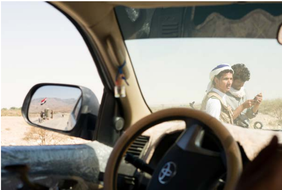
Checkpoint between Marib, al-Jawf and Sanaa.

able to return home, impressed upon me once more why resolving this conflict and others is so important.