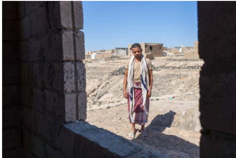
Government soldier in a new district outside Marib.