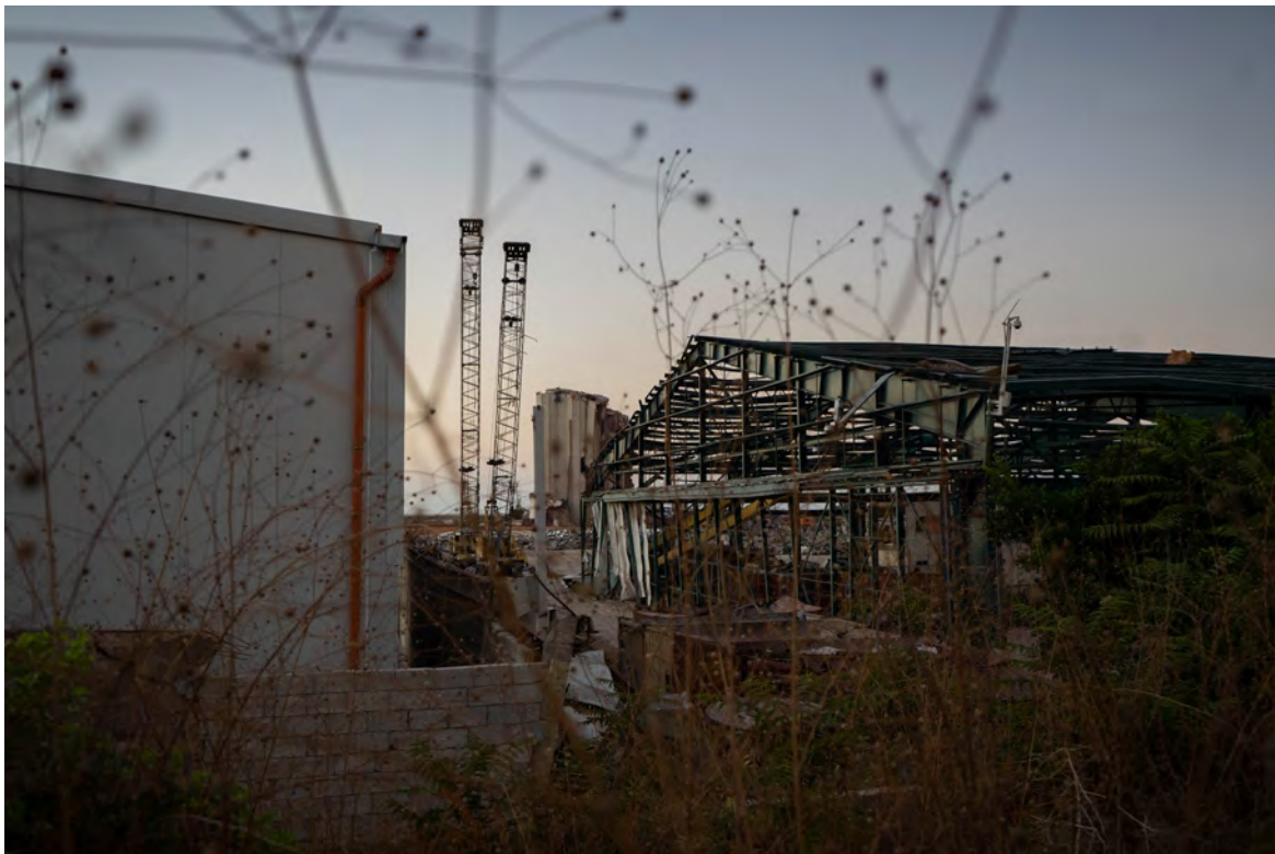
The destroyed port of Beirut.

I was in Europe on 4 August 2020, when hundreds of tonnes of ammonium nitrate improperly stored at Beirut’s port exploded in a fireball that left a crater 140m wide and ravaged buildings miles away. I found out fairly soon, when people started calling me to make sure I was all right, and I immediately started checking on friends in the city. The first friend I reached after I learned of the massive blast was unhurt. She could easily have been killed, as the explosion’s pressure wave blew out windows