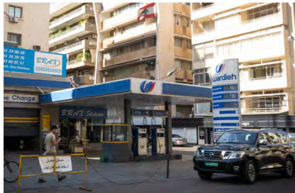
Page 1: A wedding party drives past street art in Beirut. This page: Heiko Wimmen in Batroun, a supermarket and a closed petrol station in Beirut.

Bank announces that it will lift subsidies on fuel imports, and instantly, panic sets in. Ending subsidies means gas prices will multiply four- or fivefold. The whole economy relies on motor transport, so the price hike will ripple through the country, crushing the livelihoods of battered consumers who have already lost most of their income to inflation and most of their savings to insolvent banks. The morning of the announcement, I wait in line for two hours to fill up my car's tank. But soon the queues elongate to several city blocks as everyone scrambles to top off their tanks before the government broadcasts the new, unsubsidised prices, and to find diesel for the generators they use to compensate for the failing electricity grid. Few are successful. Many gas stations seem to have closed for the day, and rumours abound that traders and gas station owners are hoarding fuel they received at the old price, hoping to make a killing by selling it off at the new tariffs or in the black market. My two-hour wait in the morning feels