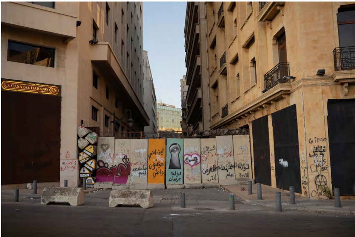
Barricades block off the Beirut central district following protests which erupted in 2019.

In reality, the sayyid sent a different message. In a speech carried live by some of the country's major TV stations, he lambasted the protesters for falling victim to foreign manipulation, or taking foreign funding, intended by embassies and their local stooges to pull Lebanon into the U.S. camp. At the square, we ran into another friend, an activist academic who had been here for a week, without much sleep from the looks of it. We asked her what she thought might happen. "Ask them", she said with a weary smile, pointing to a group of young men, mostly wearing black, who had assembled at the square's other end around a pile of loudspeakers blasting the sayyid's speech. As I moved closer to these men, the looks I got were grim and determined. The speech ended with Nasrallah calling on his followers to leave the