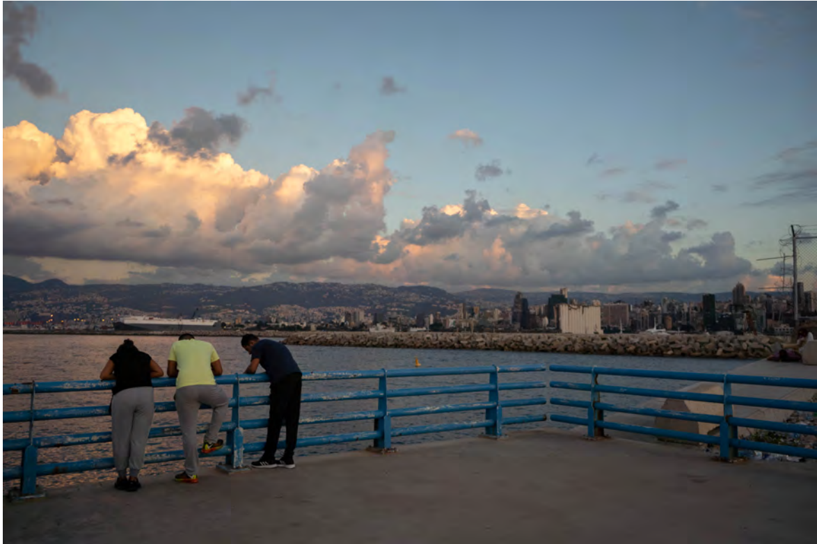
The Beirut port at sunset.

have in a broom closet, appear in the open; villages across the country are restricting gasoline sales to local residents only; in areas where the country's diverse religious groups mix, youths start raiding neighbouring villages for fuel under sectarian party flags; in the south, thugs belonging to the same party but aligned with rival kingpins who are vying for an ageing leader's mantle come to blows; and among Christians, the rhetoric of separatism, long dormant, has woken with a vengeance.