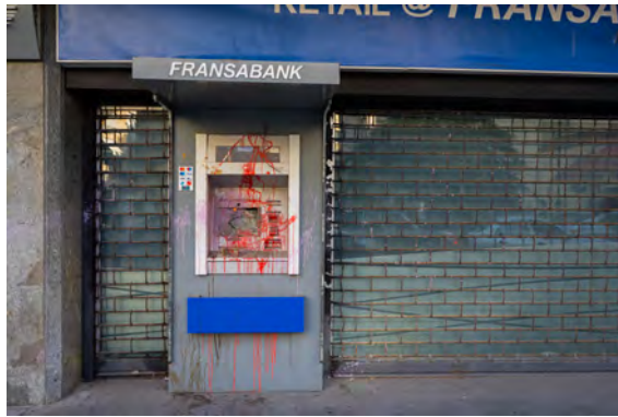
A destroyed ATM in Beirut.

squares, as the party's enemies had hijacked the protests. One of the few older men climbed onto a van, pulled out a megaphone, and directed the youths in a well-rehearsed, televised walkout. Fewer cameras were there over the next days and weeks when thugs carrying the colours and signs of Hizbollah and its Shiite ally Amal returned many times to beat up protesters, tear down tents and chant sectarian slogans. The celebration of national unity in city squares was over.