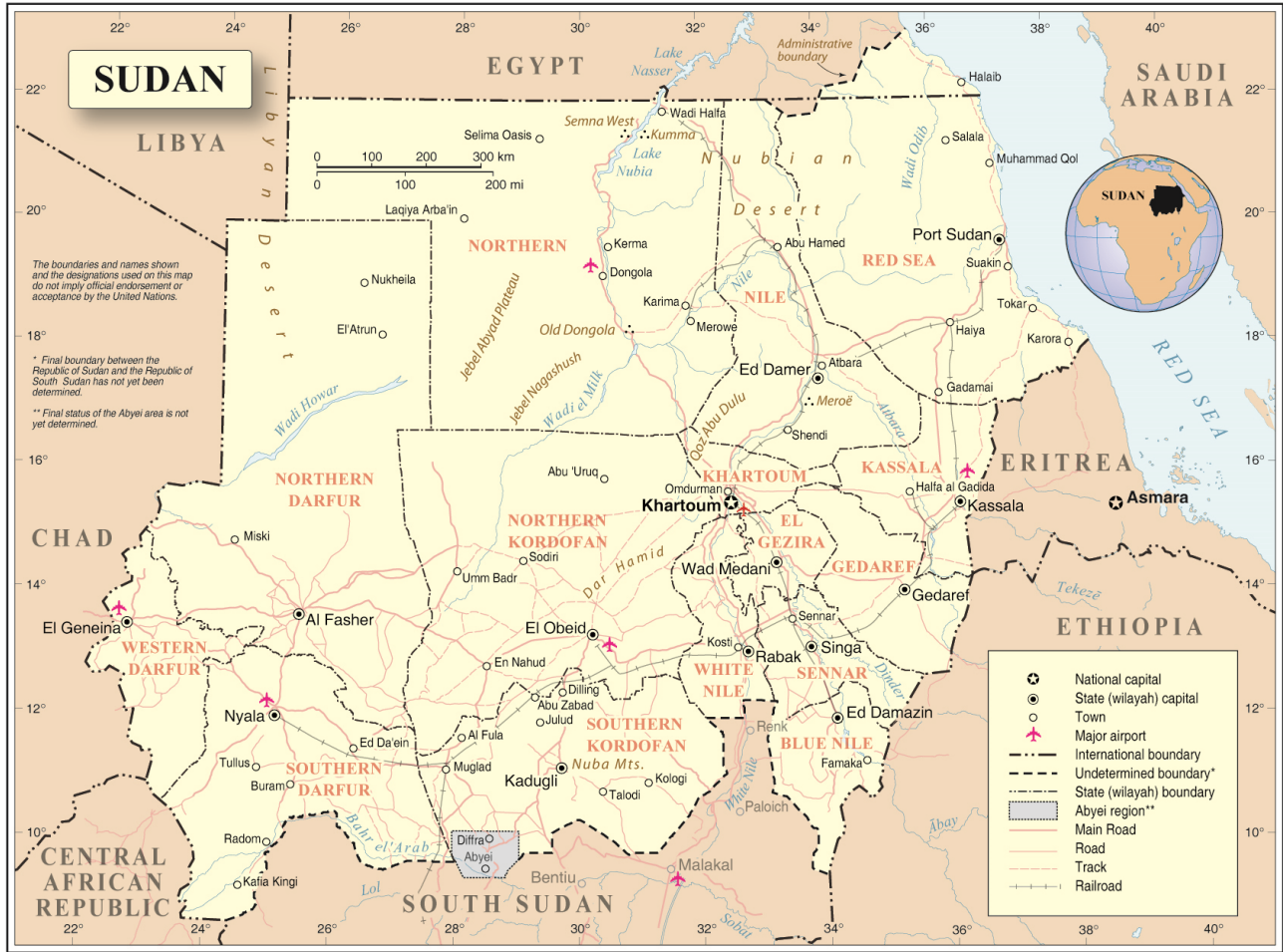
Map No. 4458 Rev.2 UNITED NATIONS March 2012